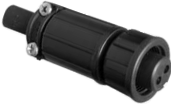
Cable Socket CXX 3106A XXXX XX S XXX